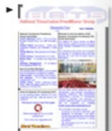
Figure 2: First BBTS TP group newsletter September 2012

The groups' membership were TPs representatives for their region. The main aim of the group was to have a reference point for discussions and queries to bring to and from their own regional TP groups. The group was tasked with deciding and arranging the TP session at the BBTS