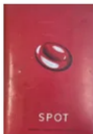
Figure 1: The SPOT members notebook

The Specialist Practitioners of Transfusion (SPOT) forum was the first collaborative group that was set up in 1999 for the newly established Transfusion Practitioner (TP) role. This forum started with 10 TPs and was to help the newly established TP role implement the 1998 Better Blood Transfusion (BBT) Health Service Circular. The rapidly expanding membership from all parts of the UK paid £15 to join and an annual membership fee of £10 for which members got a SPOT notebook and the forum had funds to host SPOT meetings and help organise annual SPOT conferences.