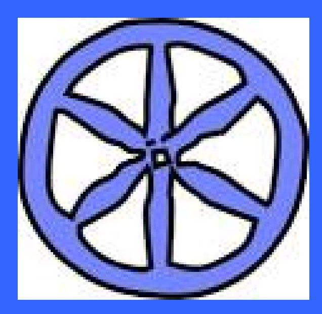
Hub and spoke